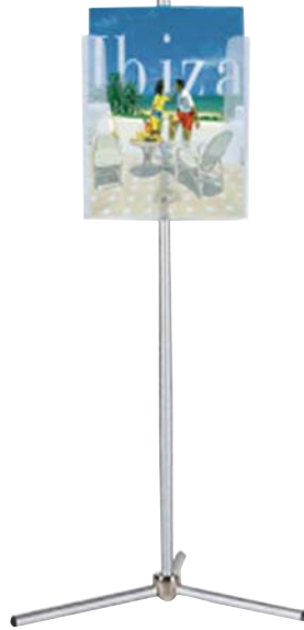
Sprint, with Graphic and Literature Holder