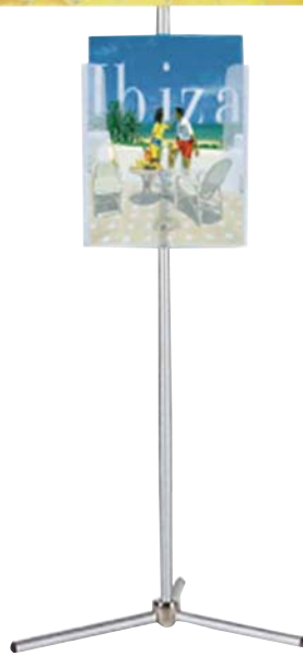
Sprint, with Graphic and Literature Holder